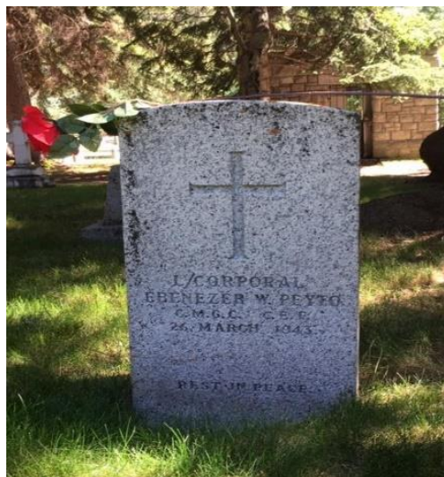
Bill Peyto's grave is located just north of the Brett mausoleum

For those desiring a more contemplative end to your tour, turn right off Caribou Street on to Otter Street and then turn left on Wolverine Street to reach the Old Banff Cemetery. Careful to close the large iron gates behind you.