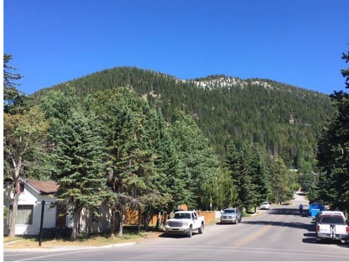
Sleeping Buffalo Mountain from Caribou Street

During the construction of the railway, there was a plan to blast a tunnel through the mountain, but wiser heads and tighter purse strings prevailed, and the railway took a slightly more northerly route. Sleeping Buffalo is one of the first mountains many people climb when visiting Banff as it only takes a couple of hours and provides great views. Stay on the trail that starts ahead of you, along St. Julien Road, towards the Banff Centre. Careful not to stray near the top as there are large cliffs on the other side!