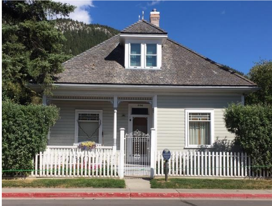
The Historic Luxton Home Museum (206 Beaver Street)