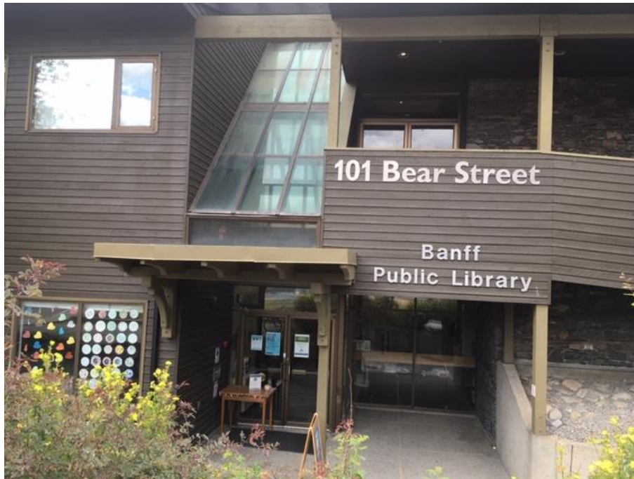
Banff Public Library