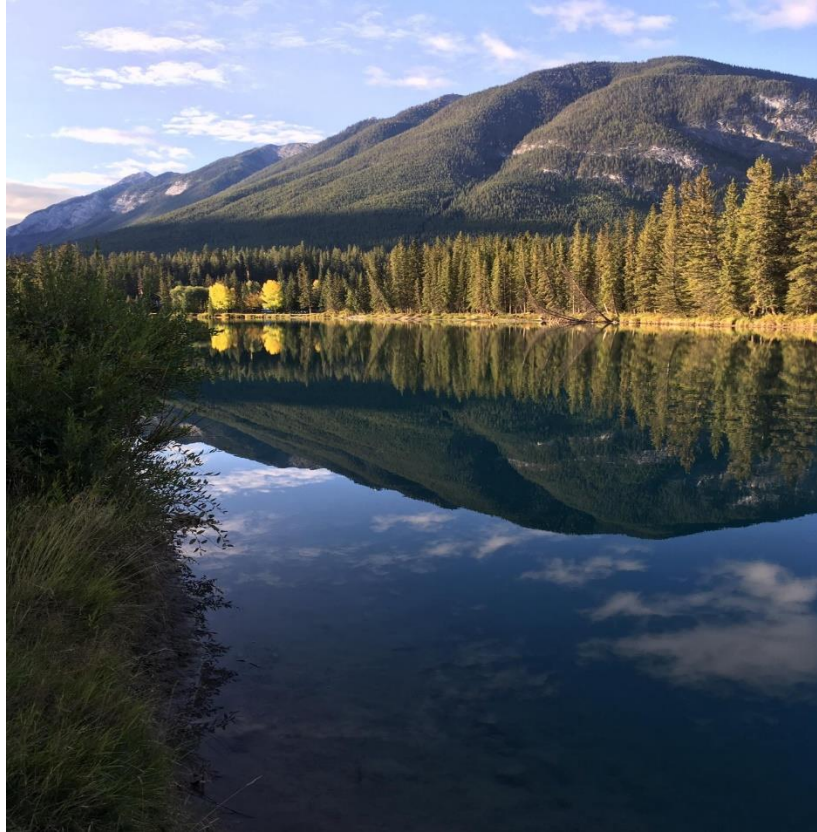
The Bow River and Sulphur Mountain