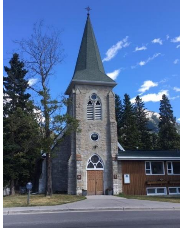
Cascade Mountain from Buffalo Street and St. Georges-in-the-Pines

It is no accident that this mountain is framed perfectly by Banff Avenue when looking north; the road was purposely aligned to provide for this view. Banff was indeed intended to be a tourist destination from the very start!