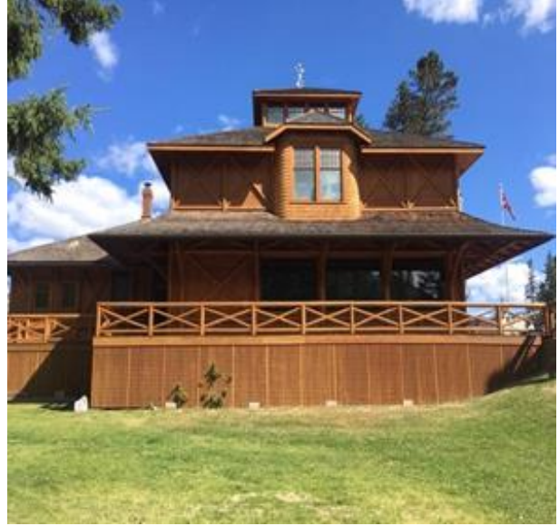
The Trono Gazebo and the Banff Park Musuem

Next you will pass the Louis Trono Gazebo on your left (named after a famous local trombone player), set amidst Banff's bucolic Central Park.